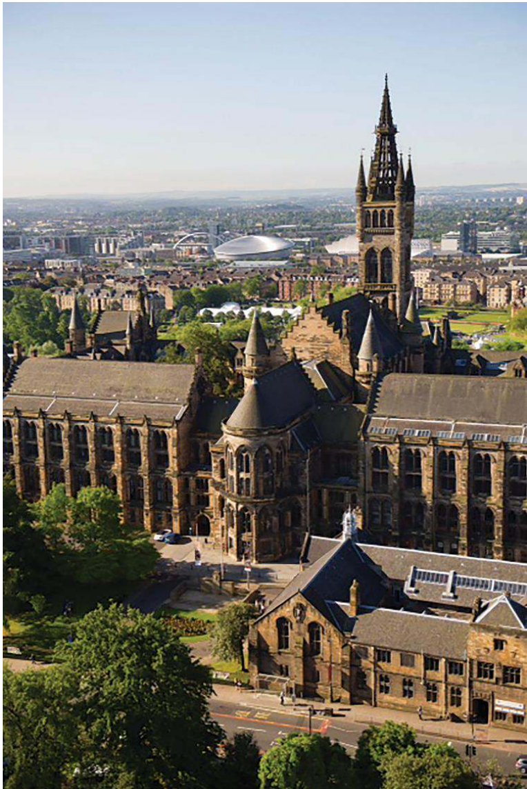
Gilbert Scott Building